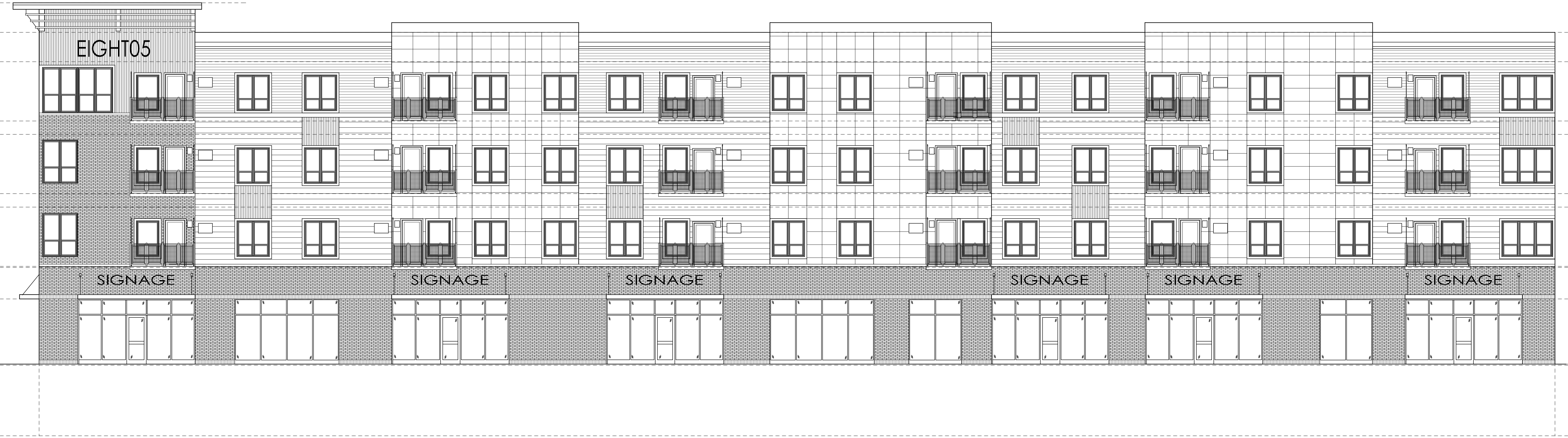
SOUTH ELEVATION SCALE: 1/8" = 1'-0"