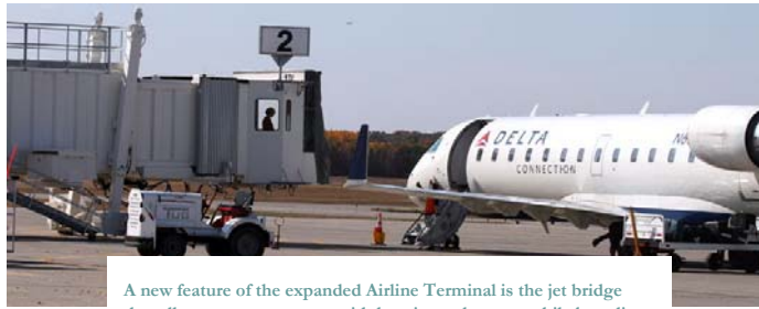
A new feature of the expanded Airline Terminal is the jet bridge that allows passengers to avoid the winter elements while boarding